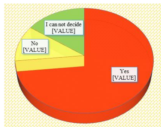
Figure 1. Performing activities requiring higher professional qualification

From the data set out in Figure 2 and its analysis of the degree of risk of professional